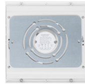
Surface Mount Bracket Included