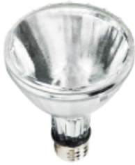
CDM PAR30L SP